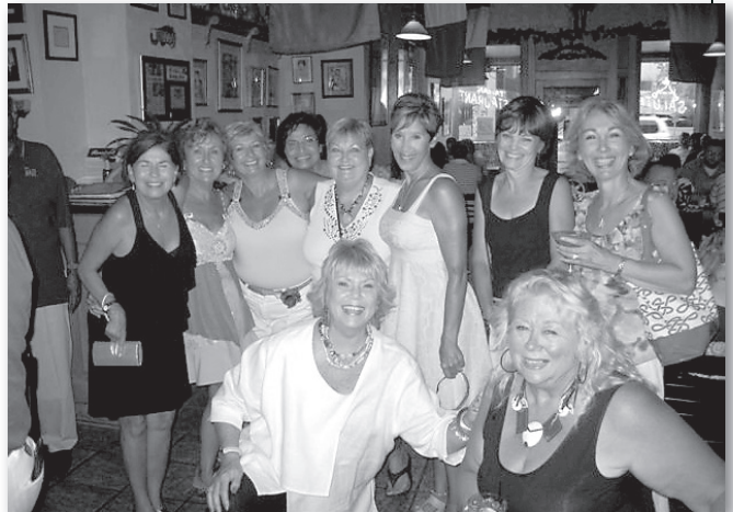
Ladies of the Rendezvous